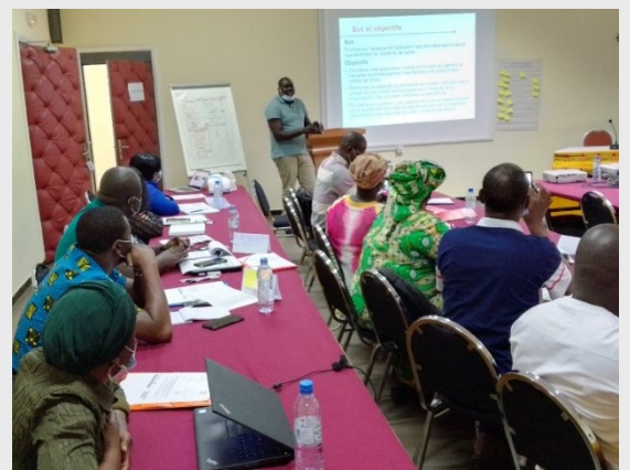
Training facility health manager on use of mobile malaria apps.

One health facility manager stated "...The access to malaria and other health program data at the health facility level is critical and with the development of new technologies we suggest to provide health facilities with electronic and communicative tools that help them to quickly calculate indicators and visualize the service performance and trends."