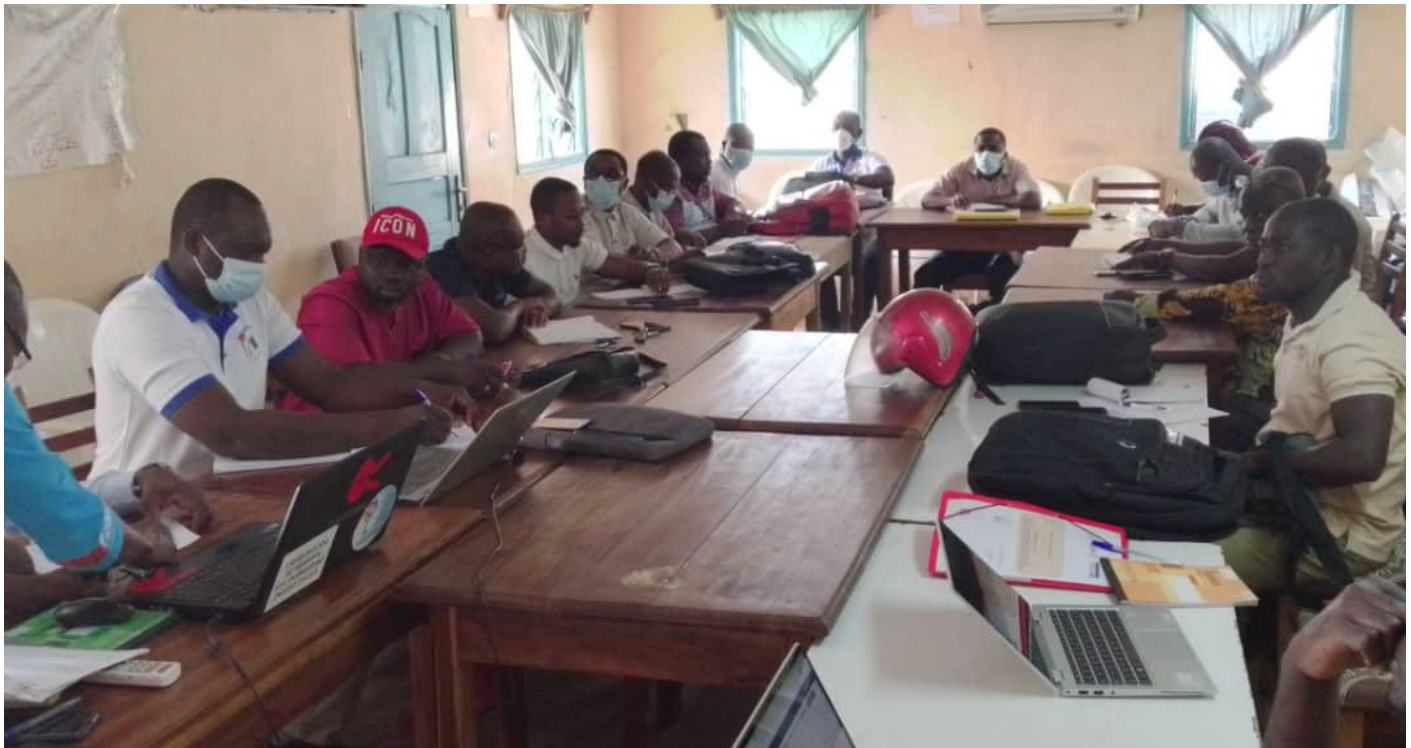
Bondoukou District data review meeting facilitated by PMM and NMCP staff using malaria mobile apps.

In Cote d'Ivoire, the Ministry of Health has established monthly meetings in each district, where health facility managers and the district team management gather at the district level to review, discuss, and monitor service delivery and commodity management performance. Paper-based data collection and reporting tools are used to cross-check data quality and to calculate indicators. The introduction of malaria mobile apps allow users to immediately view the trends and performances of each health facility and to develop action plans for each health facility to address health service delivery and commodity management issues. The implementation of plans of action are regularly monitored at the health facility level together with community health workers prior to the next monthly district meeting.