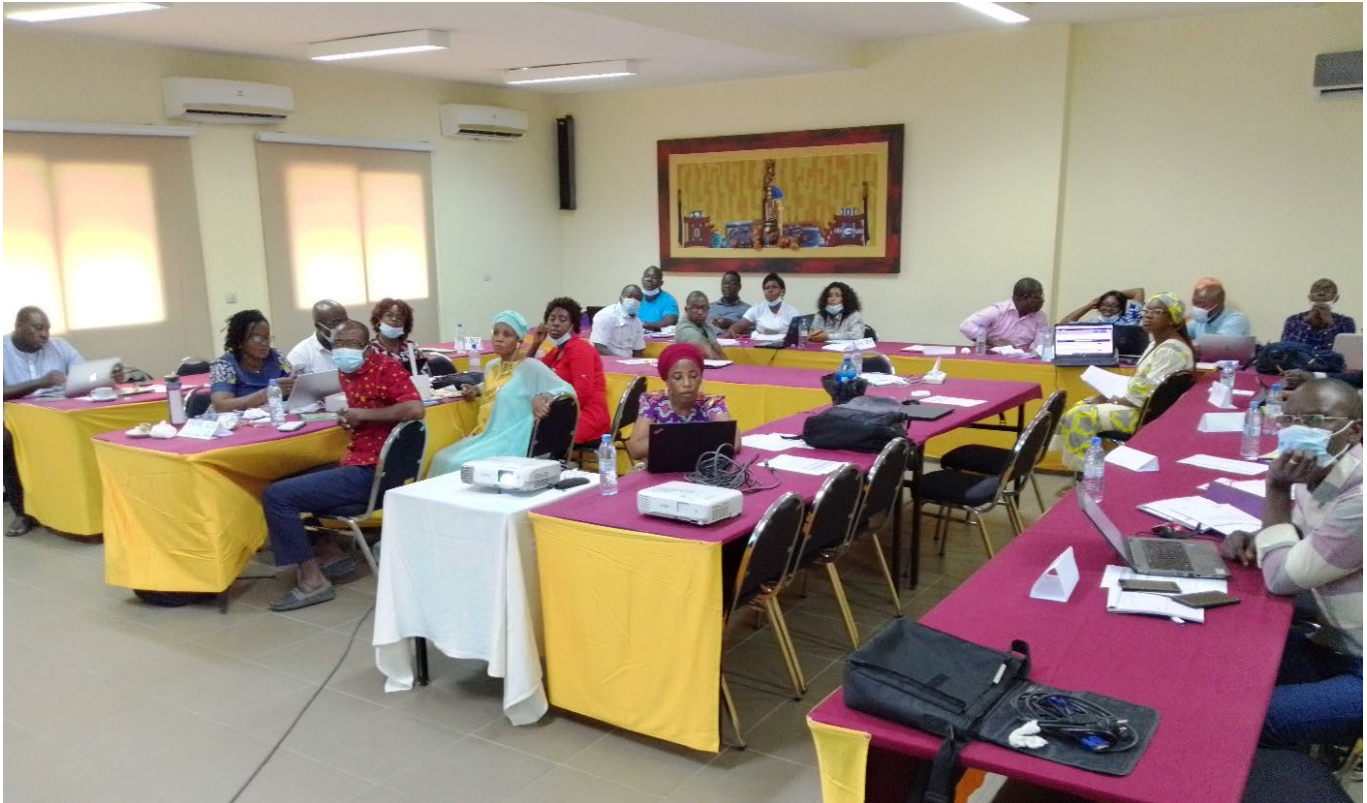
Training facility health manager on use of mobile malaria apps.

The use of malaria mobile apps is critical for real-time data access and use at the health facility level. Decisions on service delivery and commodity management are delayed because health facilities only have the opportunity to review their data and calculate indicators during the monthly district coordination meetings. With access to high-speed mobile internet and the availability of tablets and smartphones, health facility managers and partners will be able to monitor service delivery and commodity stock management performance progress and address recommendations based on evidence. To avoid errors or biases caused by paper-based data review in the calculation of indicators, the use of malaria mobile apps will help to increase health providers' accountability in terms of their own service delivery and commodity management performance.