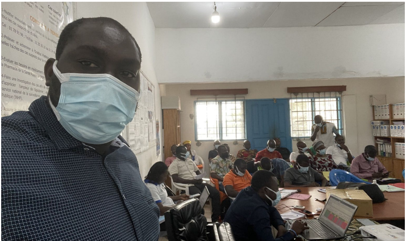
Agboville District data review meeting facilitated by PMM and NMCP using malaria mobile apps.

Despite all actions undertaken, 40% of users said two months of use is too early to make changes in their routine operations. The district will help them to develop plans of action to address the service delivery and commodity management issues.